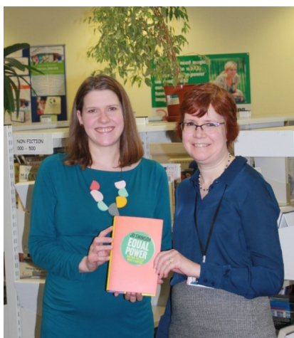
Jo Swinson donates her book to the library of Douglas Academy

It was also good to meet the S5 class and answer their questions, and hope some of the things I talked about might come in handy for them in three weeks' time when they sit their exams. I wish all the pupils the very best as exam season looms."