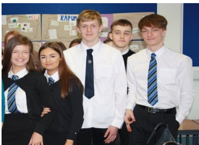
Jo Swinson meets with Douglas Academy's Higher Modern Studies class