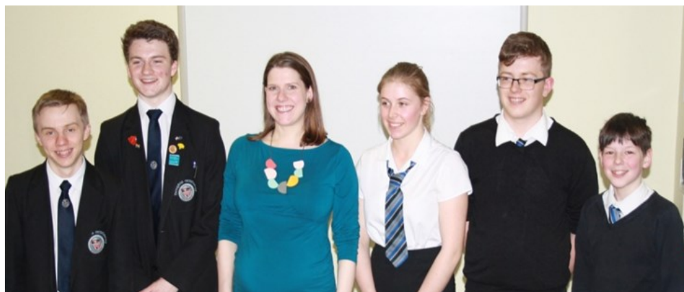
Jo Swinson debates with Douglas Academy's debating team