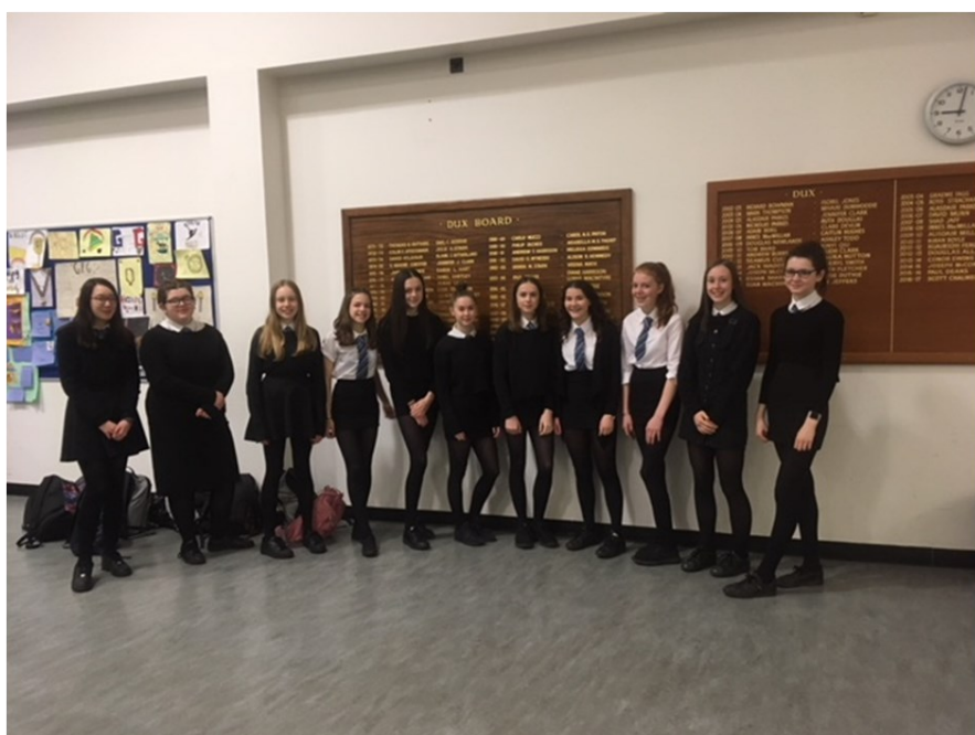
S3 Pupils who attended Glasgow Medical School Event on Saturday 21 st April.