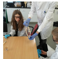
The DNA of Jelly Babies. The best kind of DNA!