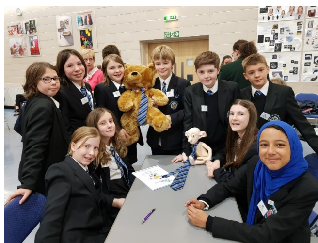
Both teams with reserves