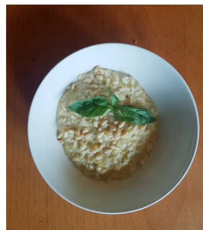
Lemon and (round!) courgette risotto with toasted pine nuts. Delicious! Thanks very much Dougie Diggers